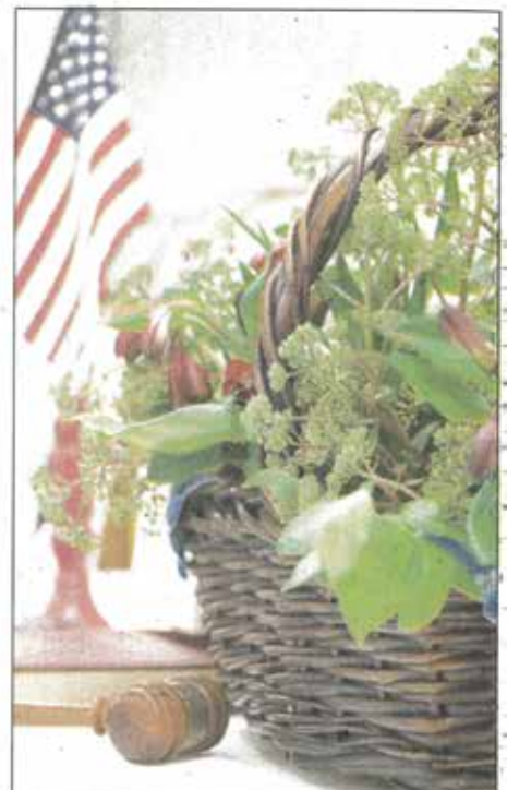
The Charles County Garden Club of Maryland Inc., which is celebrating its 80th anniversary this year, has held its flower show at the Charles County Fair since the 1940s.